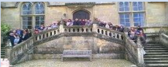
Opus 13 and Paragon Singers at Lacock Abbey

As with all twinning exchanges, strong links and friendships were forged over the weekend which will no doubt lead to further visits.