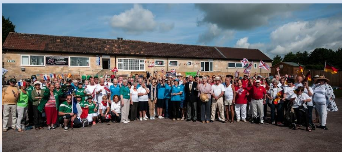
Visitors from Aix, Kaposvár and Braunschweig, with players from Austria and Jersey, in Bath for the 10 Anniversary of the City of Bath Pétanque Club